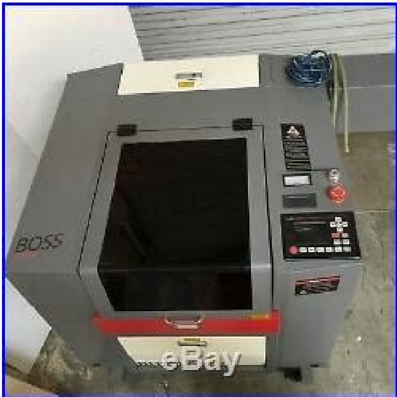
Cw 3000 industrial chiller. Cw-3000 chiller manual. Cw-3000 industrial chiller manual.

This is the safety alert symbol. It is used to alert you to potential personal injury hazards. Obey all safety messages that follow this symbol to avoid possible injury or death.